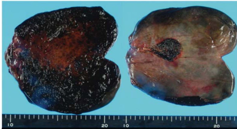
Figure 3. Abdominal operation showed the necrosis of gallbladder by torsion due to a floating gallbladder.

olecystitis as having cholecystitis due to bacterial infection and cholelithiasis. In our case, the history of steroid use also leads us to diagnose her as having acute bacterial infective cholecystitis. The presence of leukocytosis and debris in abdominal ultrasound also supported the diagnosis of acute bacterial infective cholecystitis. However, an abdominal operation demonstrated that necrosis of gallbladder by torsion due to a floating gallbladder.