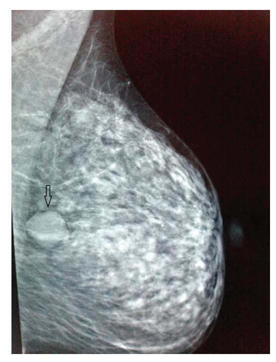
Figure 1. Left mediolateral oblique mammogram shows a multilobulated, well-circumscribed mass without calcifications, suggestive of a fibroadenoma.

Since the mass had over doubled in size over the previous 3 months, a wide local excision was performed. At surgery a well-circumscribed oval demarcated mass measuring 2.5 cm was easily resected along with a small cuff of surrounding tissues. Macroscopically, the tumor measuring 2.2 \times 2.1 \times 2 cm presented as a solid white elastic nodule with a smooth surface resembling a fibroadenoma. Histological examination of the mass revealed tubular breast adenoma. Closely approximated round and oval glandular structures composed of a single layer of epithelium and supported by a layer of myoepithelial cells were noticed. Little presence of stroma with mild fibrosis and myxoid degeneration was apparent whereas a small amount of secretion was present in the glandular lumens (Fig. 3). The patient had an uncomplicated postoperative course. She is doing well, without any evidence of recurrence 18 months after surgery.