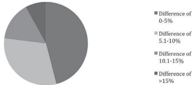
Figure 1. Demonstrates how much greater the deviation of the frozen section was from the permanent section.

frozen section diagnosis and the final diagnosis. In 33 of the cases (34%), the values between the frozen section and final diagnoses differed.