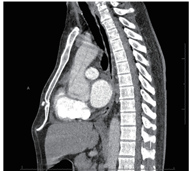
Figure 2. CTA PE protocol (sagittal view) showing descending aorta with dissection. Note contrast timing in the pulmonary vessels (scale on screen 1 cm increments). CTA: computed tomography angiography; PE: pulmonary embolism.

On physical examination, this patient was hypertensive (150/68 mm Hg), hypoxic (87% on room air), tachypneic (37 times per minute) and borderline tachycardic (98 beats per minute). He was placed on 2 L of oxygen via nasal cannula and roomed in the ED as a priority alert. He was noted to have increased work of breathing with tachypnea, accessory muscle use and coarse lung sounds bilaterally. Pulses were equal and there was no evidence of volume overload including lower extremity edema or jugular vein distention (JVD). His heart rate was regular rhythm with normal heart sounds. No neurological deficits were found in the exam. On arrival at the ED, given his presentation and acute hypoxic