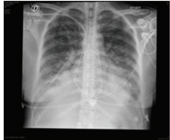
Figure 3. Following thoracic X-rays showing signs of pulmonary edema.

signs of venous pulmonary hypertension as indirect signs of heart failure. Transthoracic echocardiography found severe mitral insufficiency and mild left ventricular dysfunction with left ventricular ejection fraction of 47%, hypokinesis of lateral segments, mild tricuspid insufficiency, severe pulmonary hypertension (PASP 68 mm Hg), and right atrial enlargement.