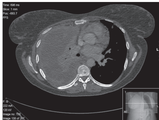
Figure 2. CT scan demonstrating pleural thickening, effusion, right lung collapse and left mediastinal shift.

A chest radiograph revealed complete opacification of the right hemithorax with mild mediastinal shift to the left side (Fig. 1). This was further characterized by a contrast enhanced computed tomography (CT) scan of the thorax, abdomen and pelvis which showed a large loculated right pleural effusion with associated right lung collapse, significant multifocal right-sided pleural thickening, and multiple pulmonary nodules on the left. No abnormalities were seen below the diaphragm, save for