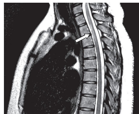
Figure 1. Sagittal T2-weighted MRI of the spine reveals a hyperintense lesion (arrow) at the T1-T3 levels of the spinal cord.

A 27-year-old African American G4P1021 presented to the labor evaluation suite at 31 + 3/7 weeks, complaining of headache, nausea, vomiting, visual flashes and unstable gait. NMO was diagnosed 3 years prior to the current pregnancy (Fig. 1), characterized by transient unilateral blindness, and a T1-T3 demyelinating spinal cord lesion, initially identified as MS, but with normal CNS MRI and CSF profile. Malar rash and positive ANA raised suspicion for co-existing SLE, but other characteristic findings were absent. NMO was diagnosed after positive anti-NMO IgG serologic testing. Symptoms of neuralgic back pain, impaired vision and ambulation resolved preconception on prednisone, azathioprine and gabapentin. The patient independently discontinued all medications in the first