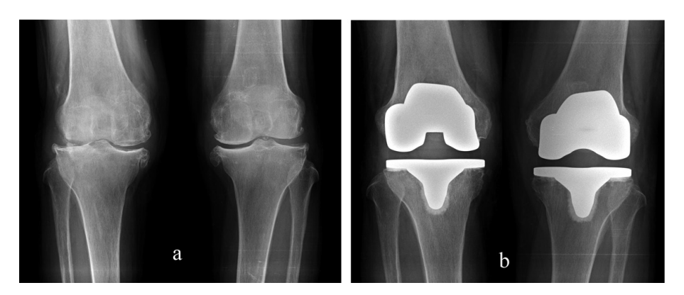
Figure 1. (a) Preoperative both knee radiographs reveal narrowing of articular space with subchondral sclerosis and spur formation. (b) Postoperative both knee radiographs reveal metallic prosthesis in both knee joints.

oxygen saturation level of 68.4%. Brain MR and pulmonary CT imaging were performed to exclude cerebral and pulmonary fat embolism. Brain MRI demonstrated multiple small dot-like high signal intensities in both the centrum semiovale and subcortical white matter on diffusion-weighted imaging (DWI), which was suggestive of cerebral fat embolism (Fig. 2).