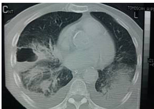
Figures 2. CT imaging of the lung abscess.

In conclusion, the successful management of this severe infection, along with its rare complication by the particular species, lied upon the combination of aggressive -but not excessive- antibiotics treatment in combination with interventional radiology applications, underlining the significance of